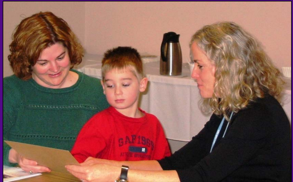
Parent-Child Consult Riverside-Albert