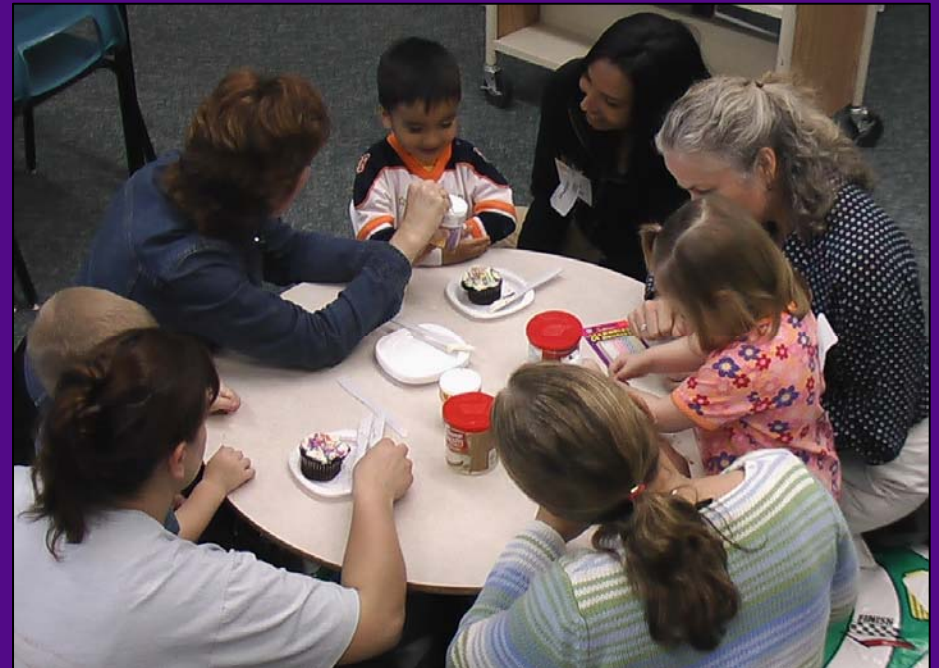
Tyke Talk session Rexton