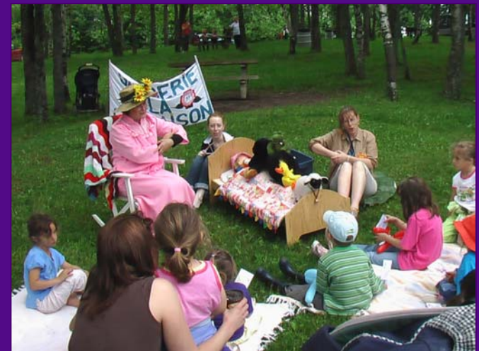
Daycare Week Celebration