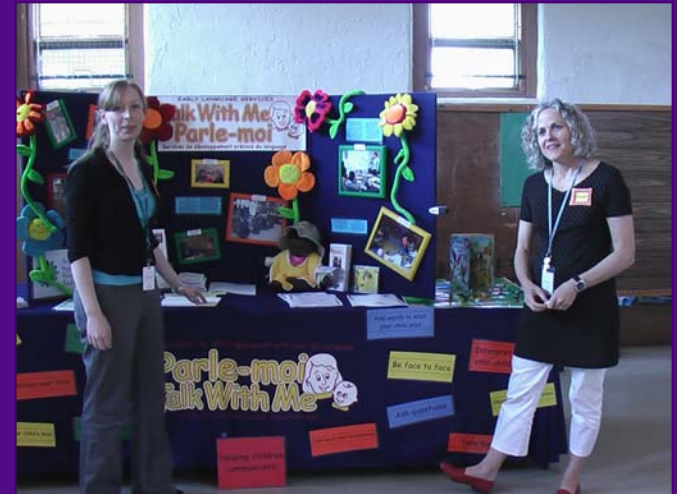
May Month Booth