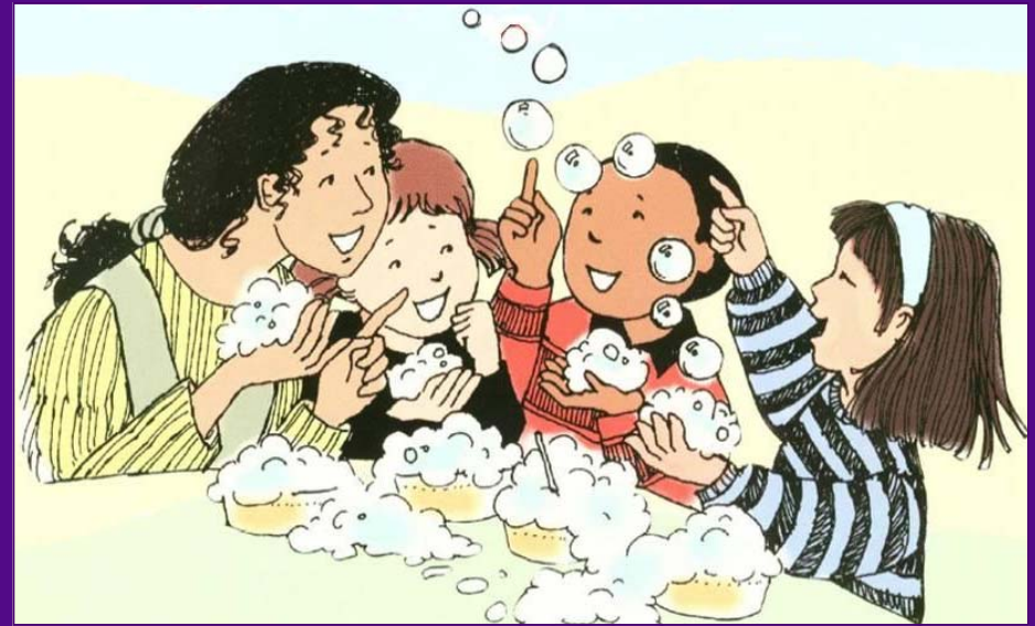
Learning Language & Loving It The Hanen Centre