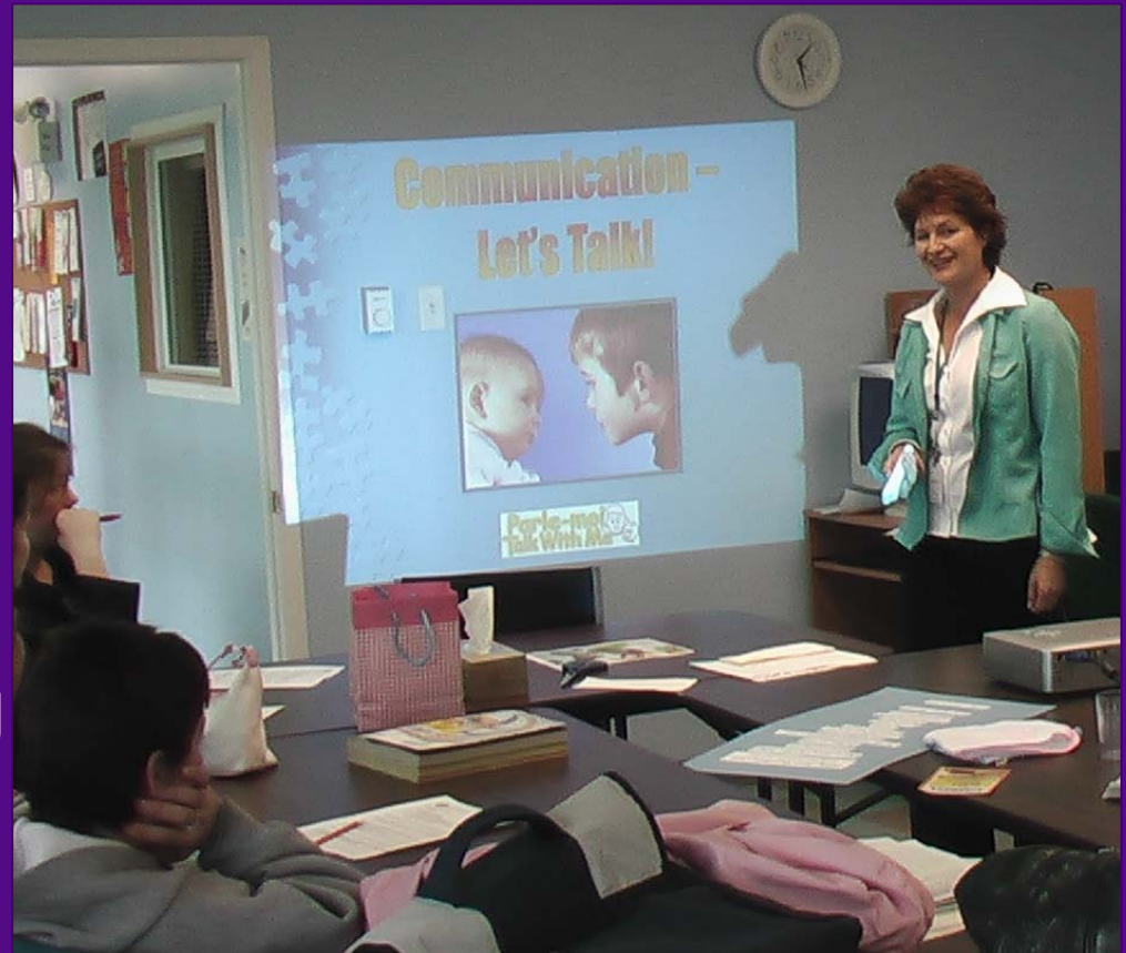
Communication – Let's Talk Turning Points Youth Parenting Centre