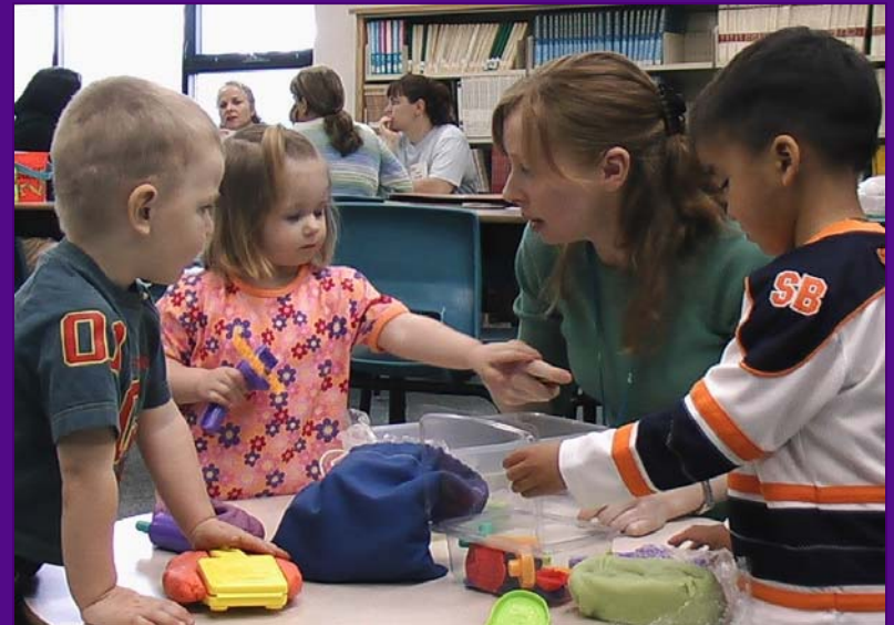
Tyke Talk session Rexton