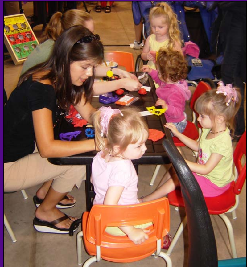
Play dough letters at PGI Fair